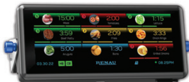
6.8" Smart Kitchen Timer

Break free from the limits of traditional channel based timers! Featuring a 6.8" touchscreen, Renau's Smart Kitchen Timer sets the new industry standard by eliminating traditional product channels and replacing them with intuitive, virtually limitless tiles. Operators can program up to 1,000 of these tiles; each containing a unique icon, description, timer, duty cycle(s), and action message(s). This level of customization essentially makes the SKT an all-in-one kitchen timer with the ability for a single unit to handle every single timed event, process, and task in the commercial kitchen.