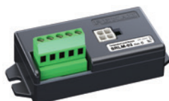
SRLM-02 2x RTD Inputs/ 1 Level Sensor Input

Whether your equipment requires RTD's or thermocouples, 1 input or 8 inputs, our Temperature Modules provide an inexpensive solution for equipment requiring parameter control.