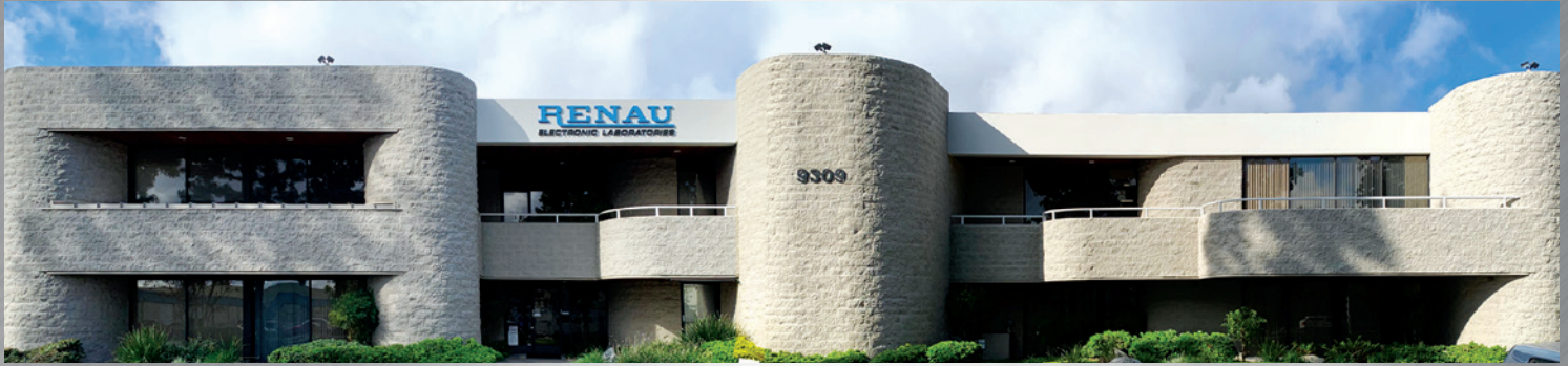
Renau Corporation - Chatsworth, California