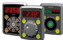
UCM-200 Series LED Display Modules