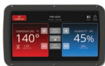
UCM-1470 7" Touchscreen Display Module