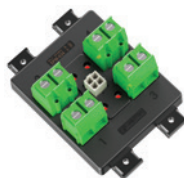
SPM-634 3x 0.5A @ 24-240VAC 1x 1A @ 24-240VAC Power Module