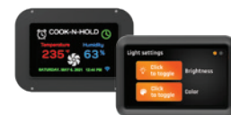
UCM-2024 Series 2.4" Touchscreen Display Modules