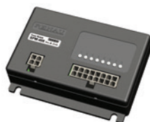
SPM-438 4x 0.5A @ 250VAC 2x 1A @ 250VAC 2x 0.5A @ 60VDC Power Module