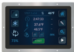
UCM-2410 10" Touchscreen Display Module