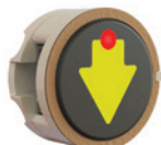
SPS-101 Single Button Switch