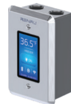
2.4" Touchscreen Walk-In Monitor and Control

Designed to cater to the needs of both equipment manufacturers and operators, the CFCM-240 is the first modular cooler/freezer walk-in monitor AND control. This provides equipment manufacturers with a complete monitor/control solution by providing full compatibility with all Renau Single Wire Modules. For operators looking to get more out of their walk-in, the CFCM provides a quick, economic route to smarter equipment. As an off the shelf product, technicians can easily replace an existing monitor with the CFCM. Once installed, add the CFCM widget to your Renau Cloud dashboard to access powerful tools such as remote alerts, data logging/graphing, and more!