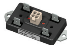
SPM-202 2x 20 Amp Outputs Power Module

In order to provide equipment functionality, you must first provide proper power regulation. Renau offers numerous power solutions capable of satisfying even the most demanding requirements. Our SPM line of power modules feature solid state relays which provide not only reliable, safe power, but also drastically increases equipment lifespan.