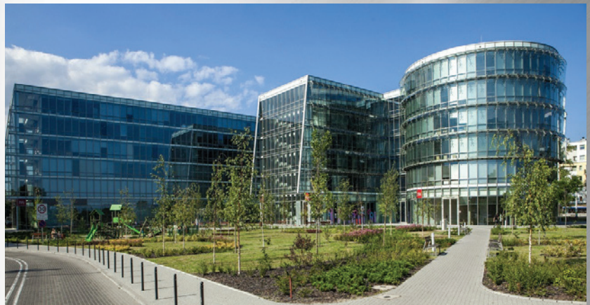
Renau Research & Development - Gdynia, Poland

Renau remains committed to its goal of providing foodservice operators with the best possible tools for ultimate customer satisfaction.