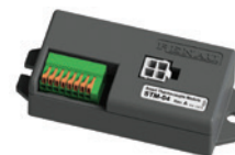
STM-04 4x Thermocouple K/J Inputs