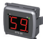
STS-20 LED Display & Timer Module