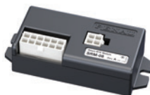
SRM-08 8x RTD 1K Ω Inputs