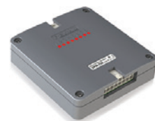
SPM-708 8x 5 Amp Outputs Power Module