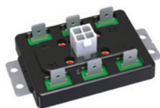
SPM-304 4x 10 Amp Outputs Power Module