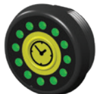
SPS-1A LED Timer/ Level Indicator

Renau's line of intuitive Switching Modules can be used as a compliment to any UCM line of display modules, or act as a standalone control. Provide quick and easy program, recipe or day-part switching for ovens, holding cabinets, dishwashers and more!